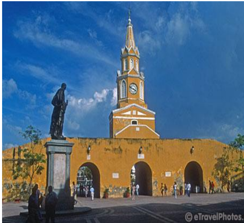
Scenes shown above are extracted from Internet sites Showcasing Cartagena de Las Indias