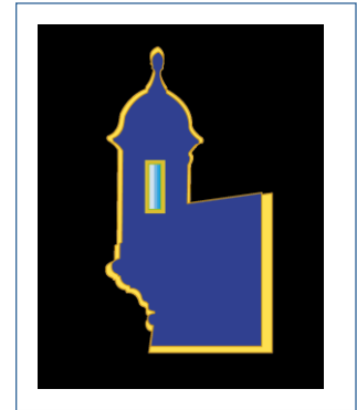
El Morro National Monument, one of many historic sites in Old San Juan.

“While papers on suggested themes are encouraged, applicants are welcome to submit proposals about other subjects and ideas.”